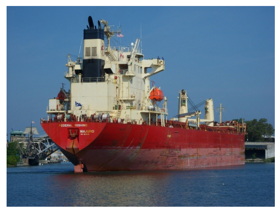
The M/V Federal Yoshino called at the Port of Lorain in early August loaded with petroleum coke headed to Mexico. She was the first saltie at the port since 2010/2011.