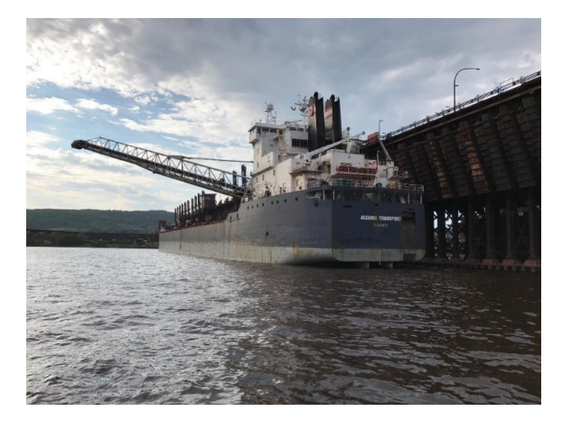
Bulk carrier \ensuremath{\text{M/V}} Algoma loading iron ore at the Port of Duluth-Superior.

Steel in/grain out — the phrase that frequently captures the binational waterway's commodity picture — is proving to be spot on in describing the cargo picture for the 2017 navigation season. Foreign-flag carriers bringing steel products into the Great Lakes Seaway System represented 109 inbound shipments to U.S. and Canadian ports. Of those foreign-flag ships delivering steel to local manufacturers in the Great Lakes region, 60 percent left with agriculture products for either direct shipment to overseas destinations or movement to transshipment ports in the lower St. Lawrence River. Through August, U.S. and Canadian grain exports throughout the Seaway totaled 4.5 million metric tons, down four percent. The outcome of the fall grain harvest will impact Seaway grain exports during the latter part of the navigation season.