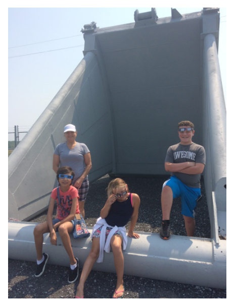
This family, ready with their special viewing glasses, couldn't wait to view the eclipse from the Dwight D. Eisenhower Visitors' Center.

it in person and today was the day. The visitor, who lives in Washington, D.C., had checked the Great Lakes St. Lawrence Seaway <u>binational website</u> for ship arrivals, got on a plane, and headed right to the locks right after landing. The tour guide said the visitor's excitement was incredible, and it was an awesome way to end the Visitors' Center season.